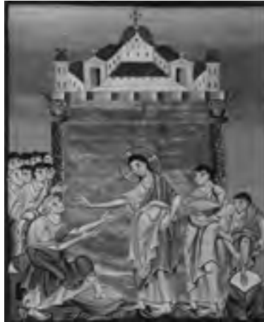
Christ Washing the Apostles' Feet is a folio illustration taken from the illuminated Gospel Book of Otto III. Produced in the late 10th or early 11th century at the Abbey of Reichenau, this folio contained the Latin Vulgate translations of the four Gospels.