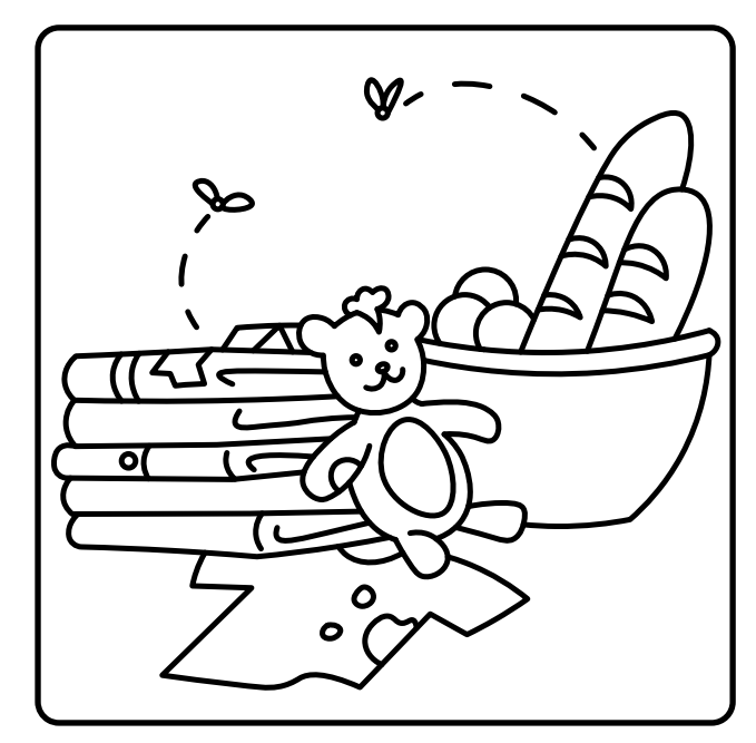
2. The kingdom of God is different from other kingdoms where people store up riches and fancy things. A collection of things can be stolen or spoiled, or eaten up by moths. But God's kingdom cannot be destroyed.