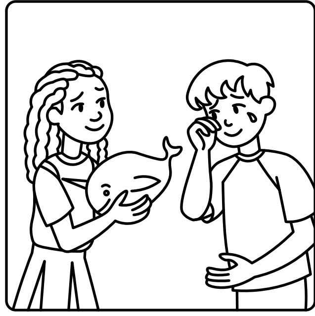
3. Jesus tells the disciples to give their possessions to people who go without and make space for blessings that cannot be taken away or ruined. Be ready to receive the treasures of God's kingdom.