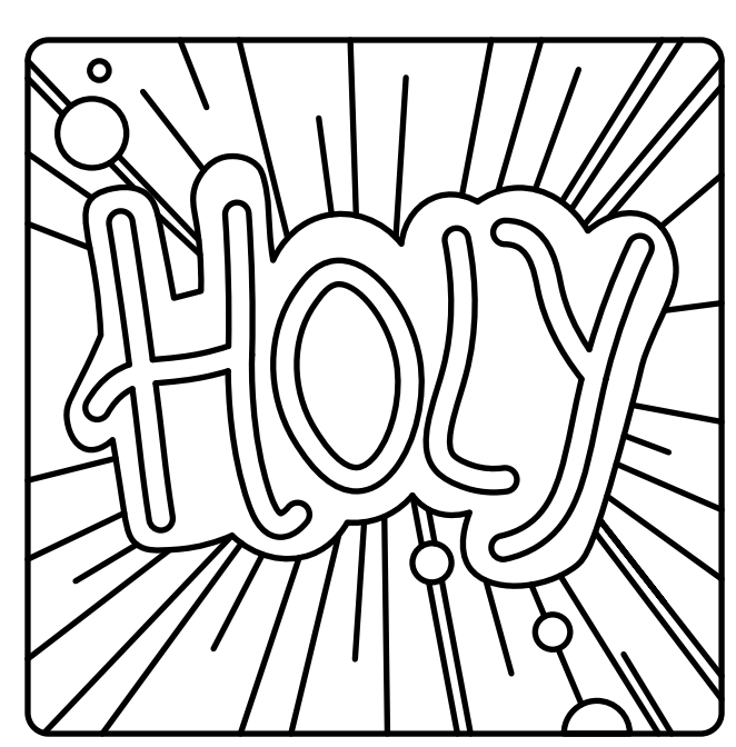
3. God, I know your way is holy. What other god is as great and powerful as you, God?