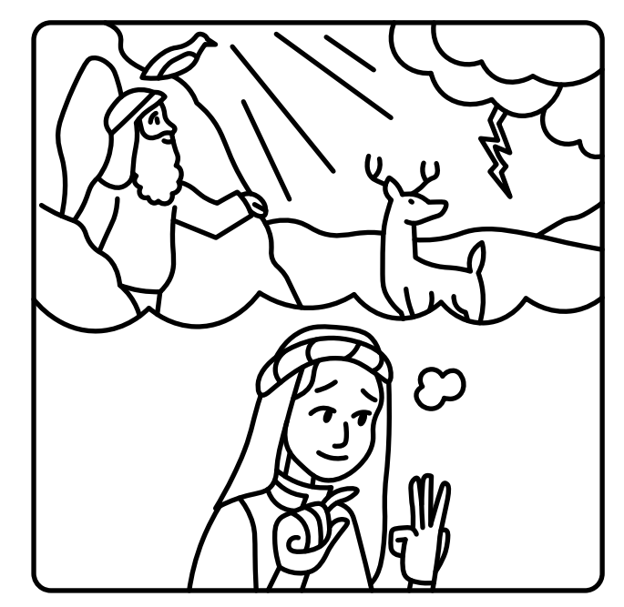
2. I remind myself of all the good things you, God, have done. God, I remember all the wonders you have done since the beginning of time. I focus my thoughts on your good works and your mighty actions.